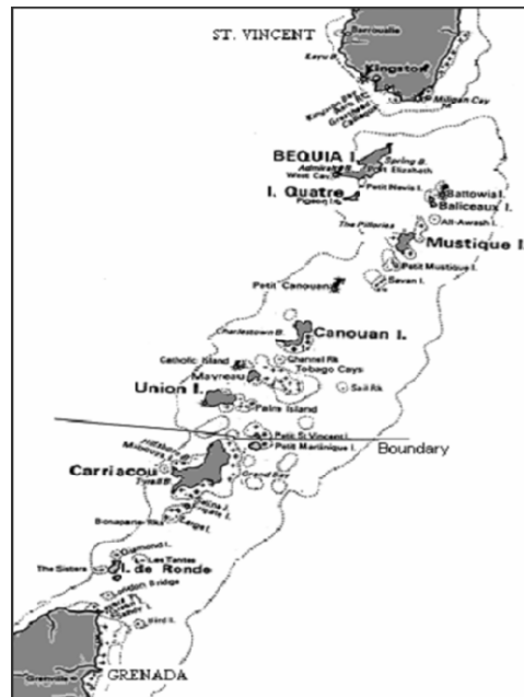
Figure 1. Geographic location and detail of the transboundary Grenadine Islands of the Grenada Bank (Adapted from Sustainable Grenadines Project 2005).

Both Governments perceive their Grenadine Islands as having high potential for tourism and associated development, whilst also recognising their current value and long tradition of supporting coastal communities through fishing. They are also well aware of the high vulnerability of the marine resource systems of the area, to environmental degradation, and the dependency of sustainable development on conservation of the resources (Sustainable Grenadines Project 2005). Both countries are party to a large body of international and regional environmental agreements and possess national legislation and regulations to promote sustainable development and protect and conserve marine resources and biodiversity (Mattai and Mahon 2007).