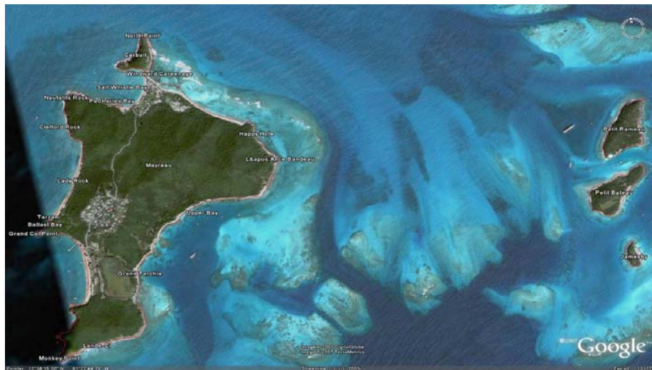
Figure 4. An example of how the basemap was annotated with local 'topogy' supplemented with Google Earth satellite imagery in order to aid stakeholders' recognition in mapping exercises.